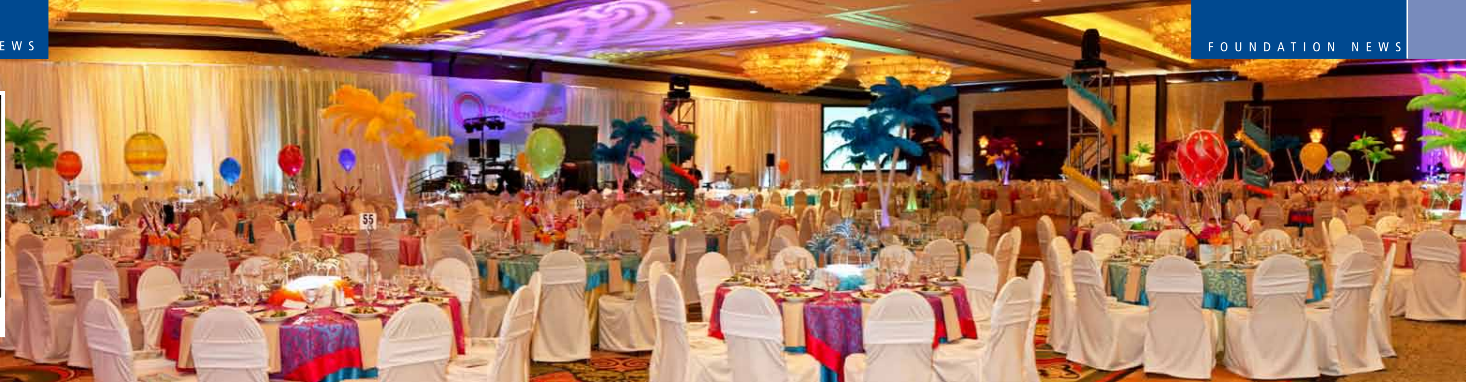
A festive ballroom greets HCC Opportunity Ball guests