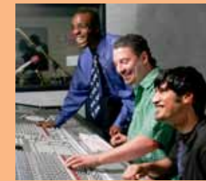
Audio Recording & Filmmaking

HCC students seeking a career in the music industry are hitting a high note thanks to training from award-winning faculty with industry experience.