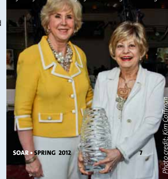
SOAR • SPRING 2012